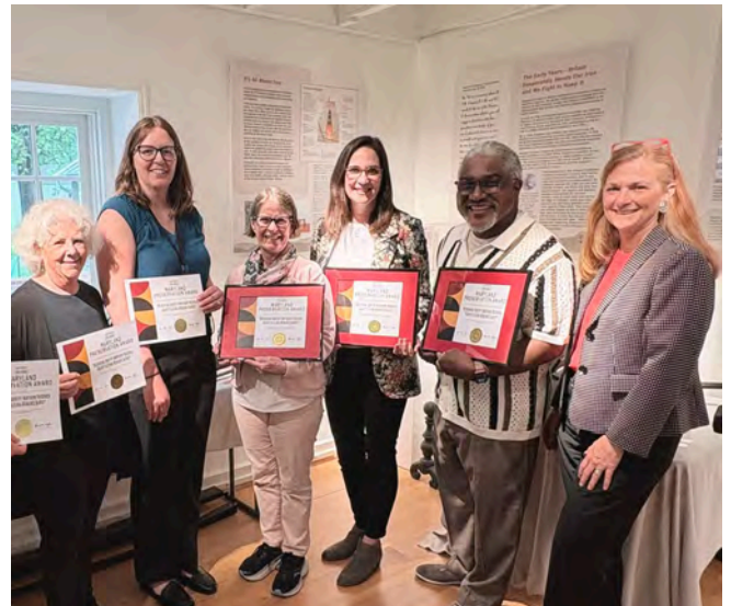
"Recovering Identity" Survey" (Frederick County) | Excellence in Media and Research 2025

Award recipients and nominators will be notified by email following the Board's selection in March. Awards will be presented on-site (or at a site of the awardee's choosing) for a live-streamed presentation in May, to coincide with Preservation Month. Check the Maryland Preservation Awards webpage for the latest information.