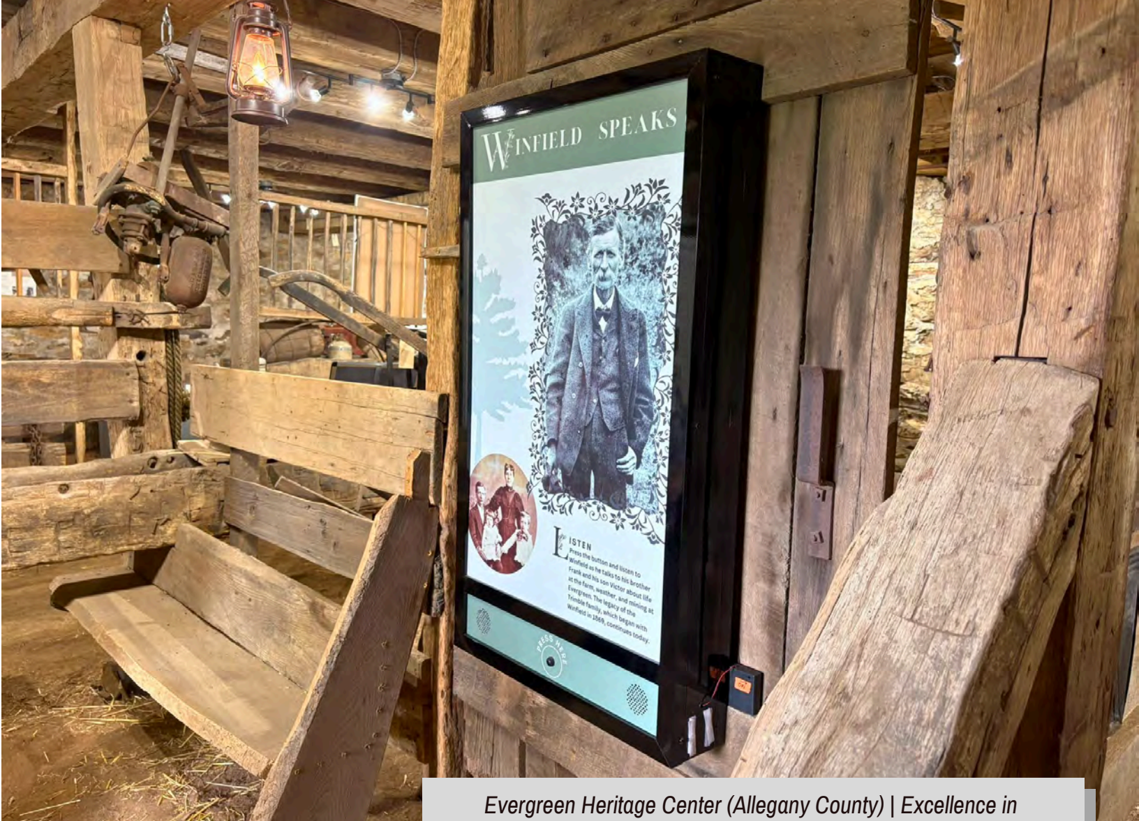
Evergreen Heritage Center (Allegany County) | Excellence in Community Impact 2025 for the Appalachian Time Travel Program

The Maryland Preservation Awards, presented annually since 1975 by the Board of Trustees of the Maryland Historical Trust (MHT), are the highest level of recognition for historic preservation, heritage education, and community development projects in Maryland.